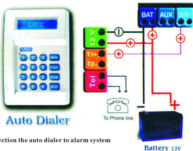
Connection the auto dialer to alarm system